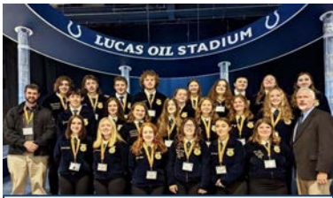
Agriscience at FFA Convention