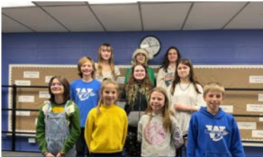
WMS CMEA Auditioners