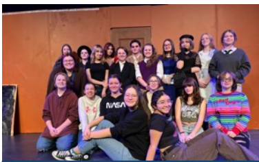
Cast & Crew of "Clue" at NHS