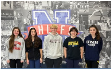
All-State NHS Fall Athletes